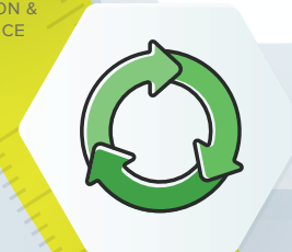
END OF LIFE