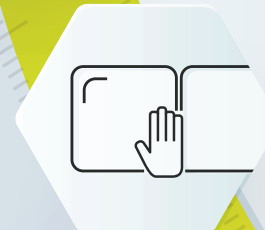
INSTALLATION & MAINTENANCE