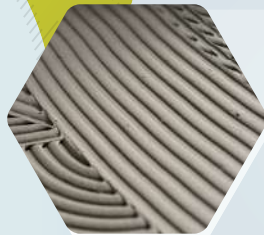
MORTARS & GROUTS